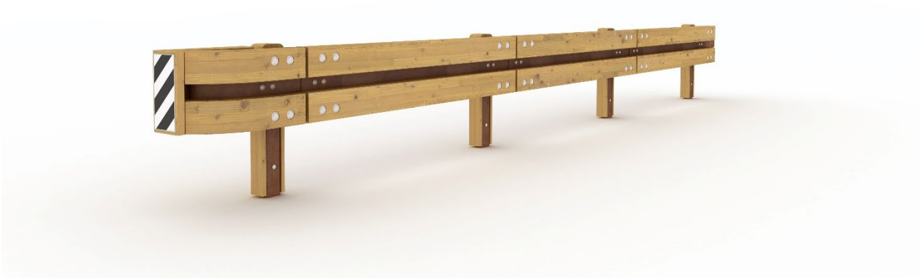
Figure 1 Transparent surface treatment, natural color

The T50-01 is a certified terminal for road side barriers designed in collaboration with CrashTech. Compatible with all products in the range, it is an energy absorbing terminal in laminated wood and steel and has been successfully tested for Class T50 performance according to CEN/TS 1317-7.