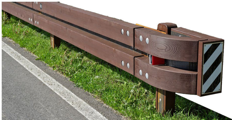
Figure 2 Deep brown color surface treatment